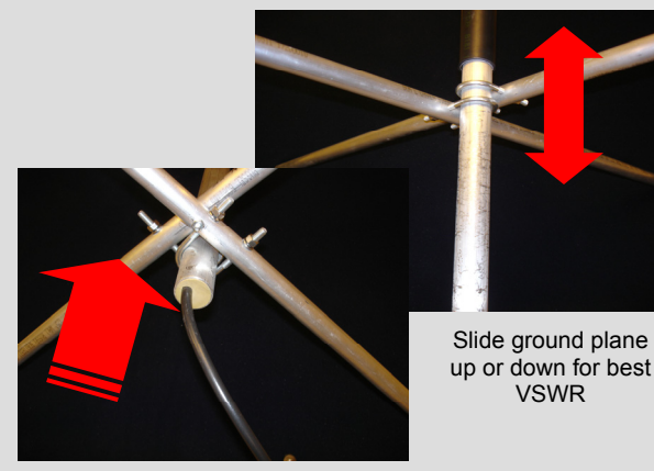
Slide ground plane assembly over feed cable and onto antenna

*Site-specific mounting hardware is necessary with theses antennas. Please consult JAG to determine suitable clamps for your application