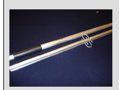
Antenna pulled from shipping tube