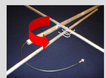
Spread ground plane radials 90-deg apart